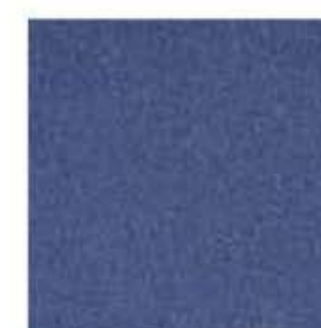
dark blue 6810