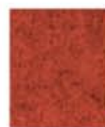
Edge Hill CUZ99