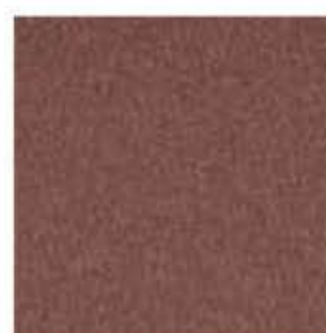
dark brown 6815