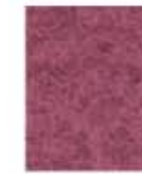
St Martins CUZ1X