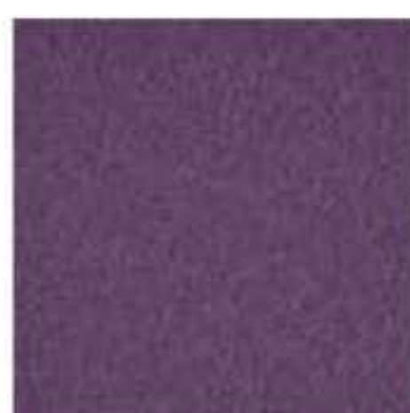
deep purple 6811