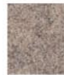
St Andrews CUZ86